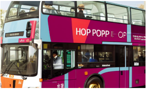
Hop on-Hop off