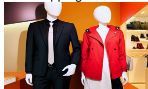
Men's wear Women's wear