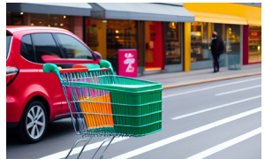
Shopping trolley Shopping basket